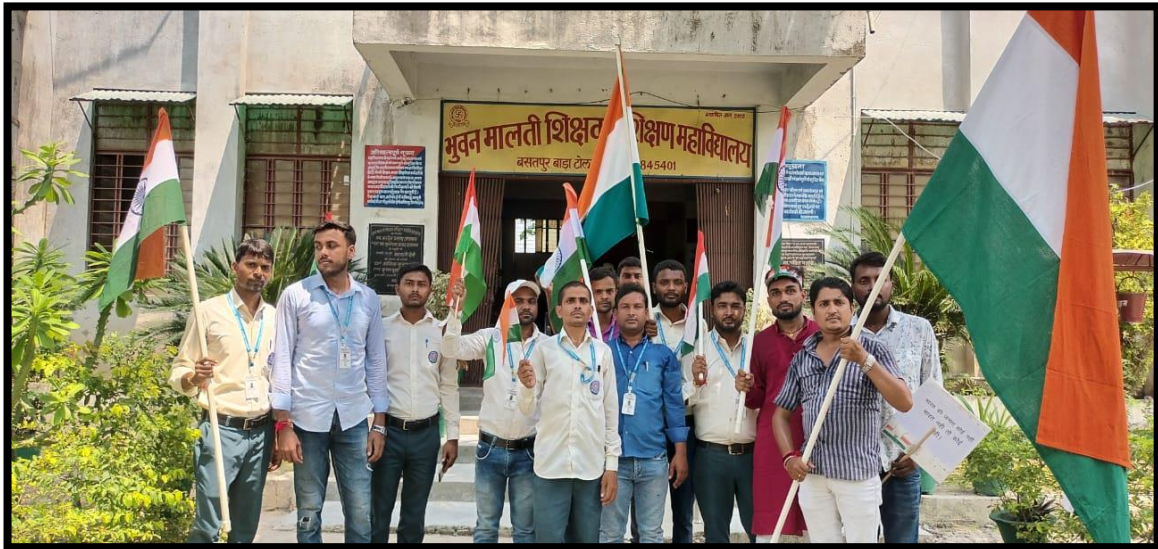
Har Ghar Tiranga Awareness Programme organized in college on date3d -13/08/2022

The "Har Ghar Tiranga" (A Flag in Every Home) Awareness Programme is a nation wide initiative aimed at fostering a sense of patriotism and national pride among Indian citizens by encouraging them to hoist the national flag, the Tiranga, at their homes. Here's a report summarizing the key aspects and impact of the program: