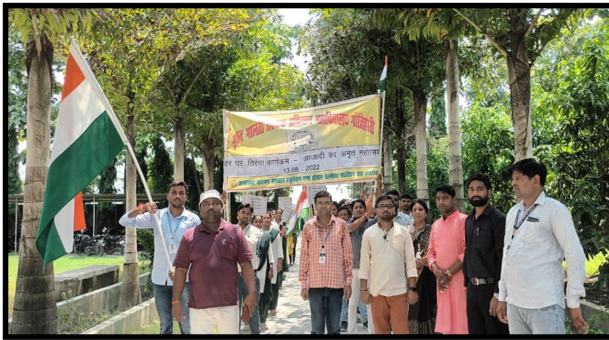
Har Ghar Tiranga Awareness Programme organized in village

The program is implemented through various channels, including government agencies, educational institutions, non-profit organizations, and community groups. Awareness campaigns are conducted through media channels, social media platforms, and grassroots outreach efforts to educate citizens about the