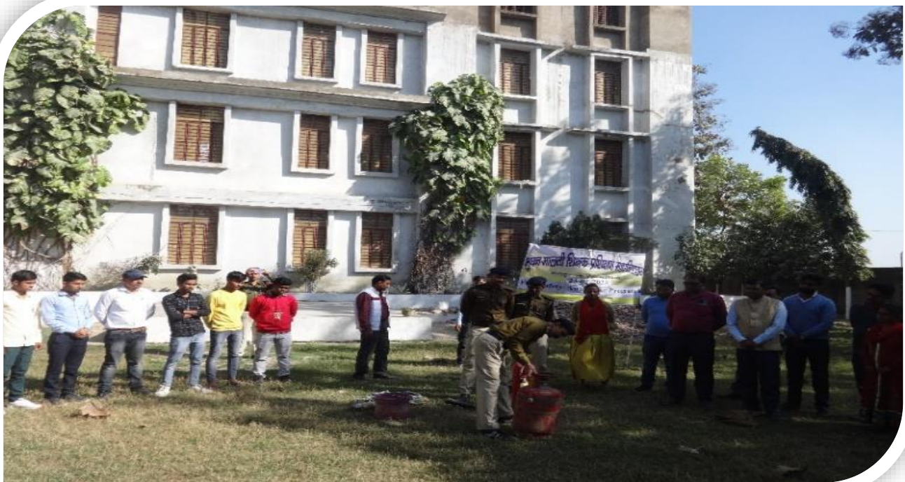
Fire Officer gave instructions to the trainers of B.Ed. first year and D.El.Ed. first year about safety awareness Date-23/02/2023